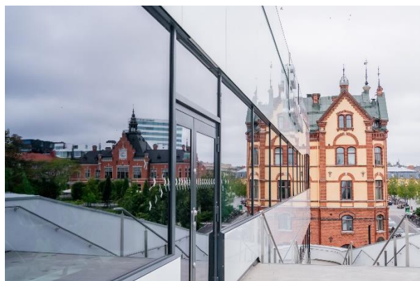
Photo: The yellow and red building is Stora Hotellet. The red building, reflected in the window is the restaurant Rex.

Transfer/Distance: 1 hour 20 min (110 km) from Örnsköldsvik to Umeå